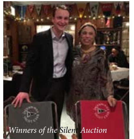
Winners of the Silent Auction