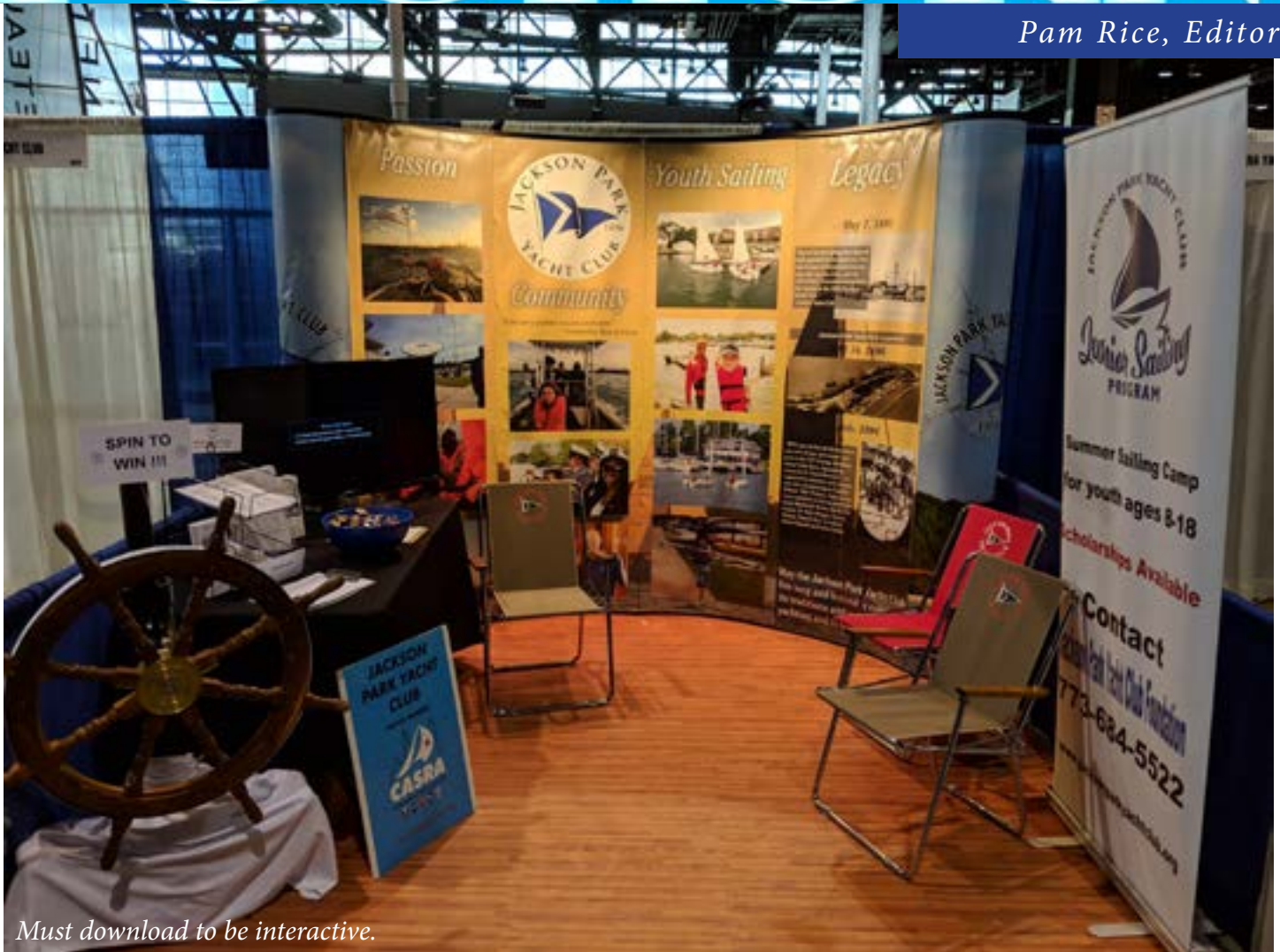
Must download to be interactive.