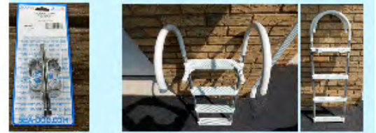
Swim Ladder for Gunnel/Transom $15.00