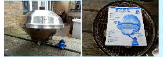
Magma Stainless Steel Gas BBQ Stove $75.00