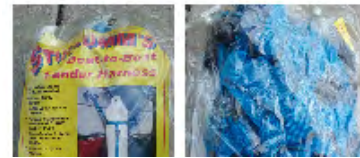
Fender Harnesses 2 in the pack