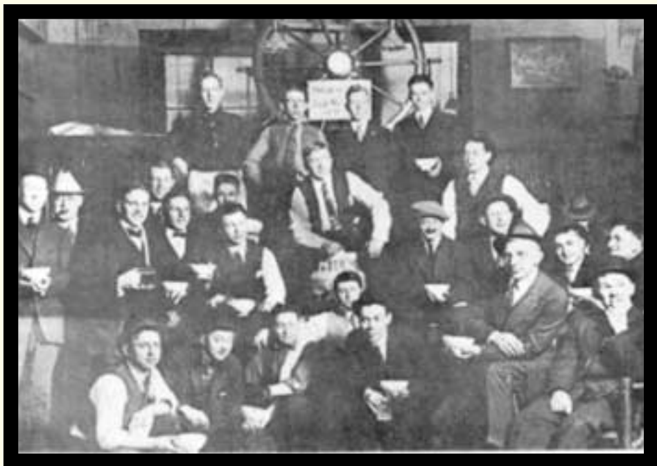
Oldest existing picture of JPYC and its members.