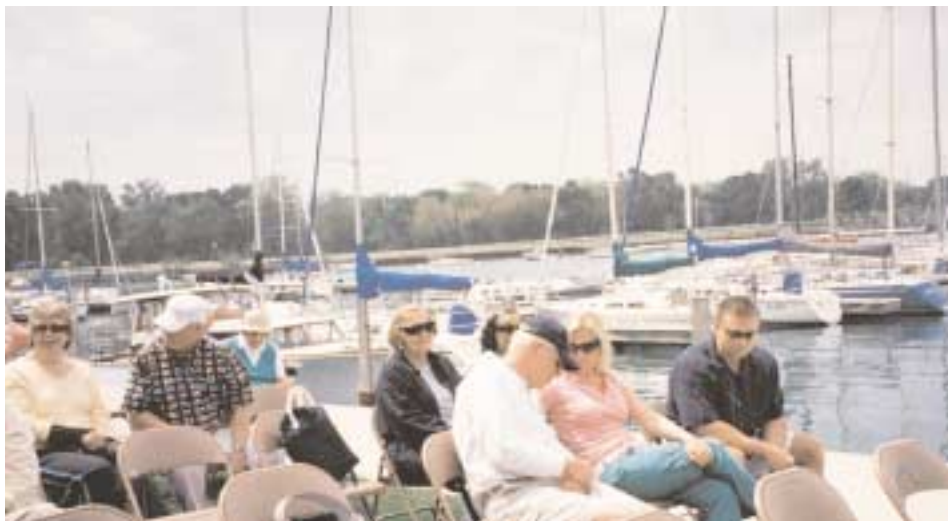
JPYC Opening Day Guests

RESERVATIONS MUST BE RECEIVED BY 5:00 PM FRIDAY JULY 8