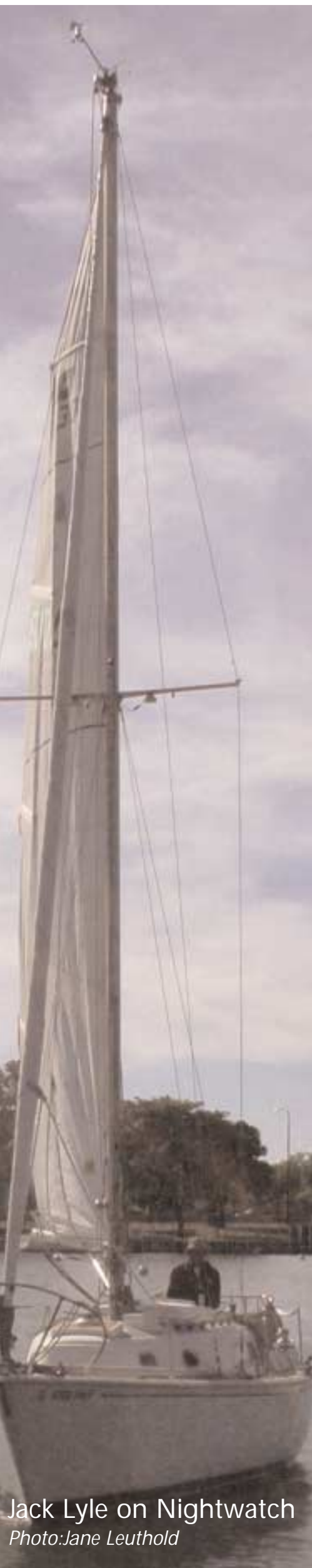
Jack Lyle on Nightwatch