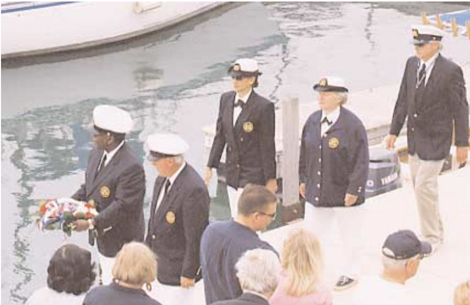
JPYC officers were called to place the Memorial Wreath in the water.